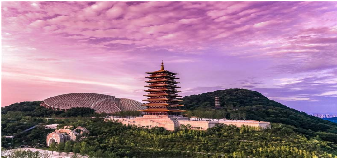
Nanjing Niushou Mountain