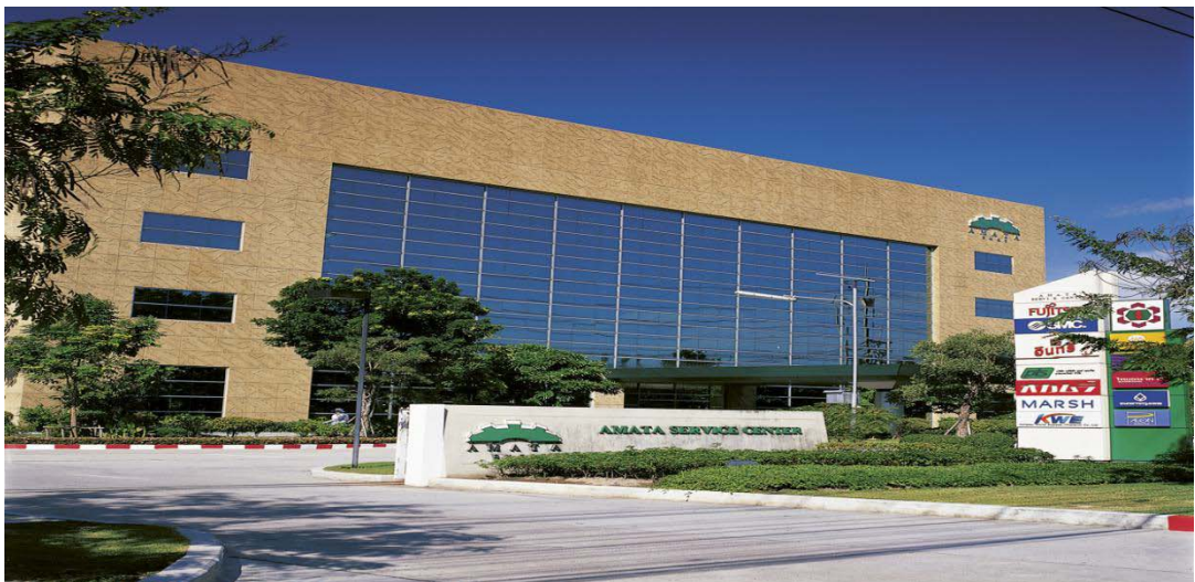
Amata Corporation PCL