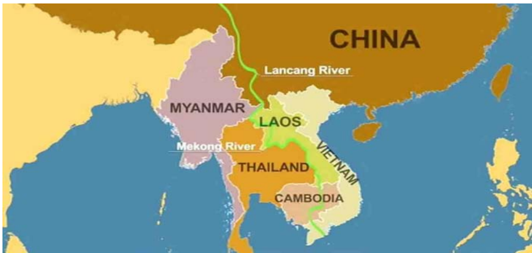
The Lancang-Mekong River Basin